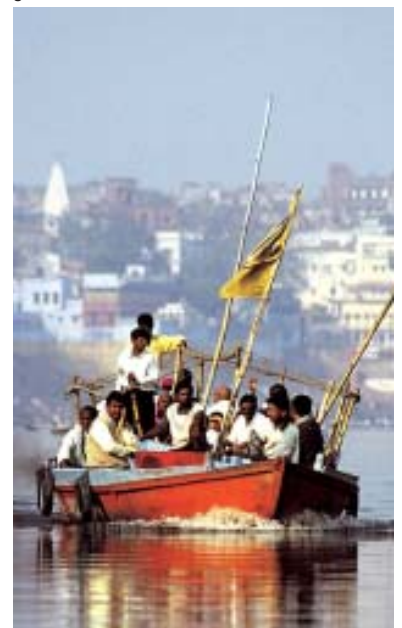
1. Dawn at Assi Ghat on the Ganges