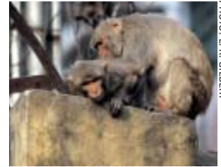
1 & 2. Everyone has daily chores